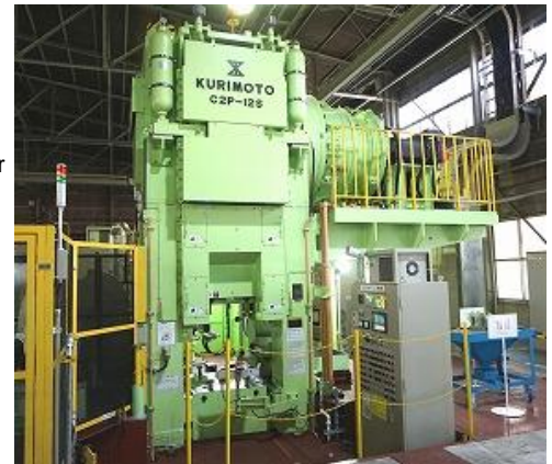
Exterior view of servo press